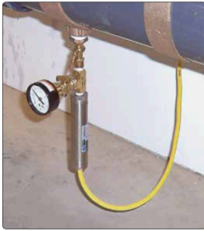
• Model 3400H and Dial Gage Pressure Transducer on a tee fitting.