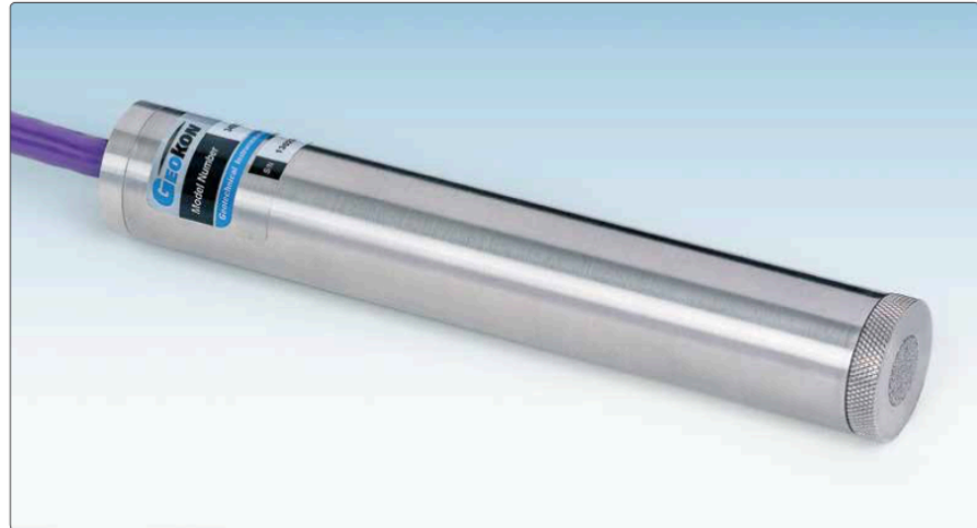
• Model 3400S-1/2 Semiconductor Piezometer.