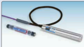
• Model 3400SV-1/2 Semiconductor Vented Piezometer.